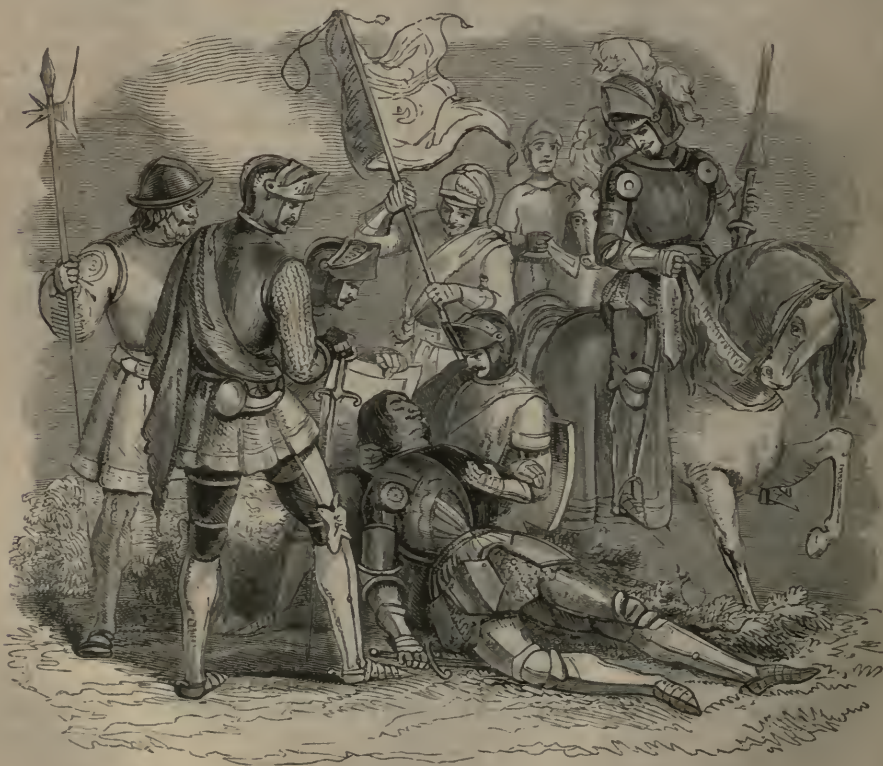
DEATH OF DOUGLAS. Designed from MS. Illuminations of the 15th century.

THE young earl of Douglas had this night performed wonders in arms. When he was struck down, there was a great crowd round him; and he could not raise himself, for the blow on his head was mortal. His men had followed him as closely as they were able; and there came to him his cousins, sir James Lindsay, sir John and sir Walter Sinclair, with other knights and squires. They found by his side a gallant knight that had constantly attended him, who was his chaplain, and had at this time exchanged his profession for that of a valiant man at arms. The whole night he had followed the earl with his battle-axe in hand, and had by his exertions more than once repulsed the English. This conduct gained the thanks of his countrymen, and turned out to his advantage, for in the same year he was promoted to the archdeaconry and made canon of Aberdeen. His name was sir William of North Berwick. To say the truth, he was well formed in all his limbs to shine in battle, and was severely wounded at this combat. When these knights came to the earl of Douglas, they found him in a melancholy state, as well as one of his knights, sir Robert Hart, who had fought by his side the whole of the night, and now lay beside him, covered with fifteen wounds from lances and other weapons.